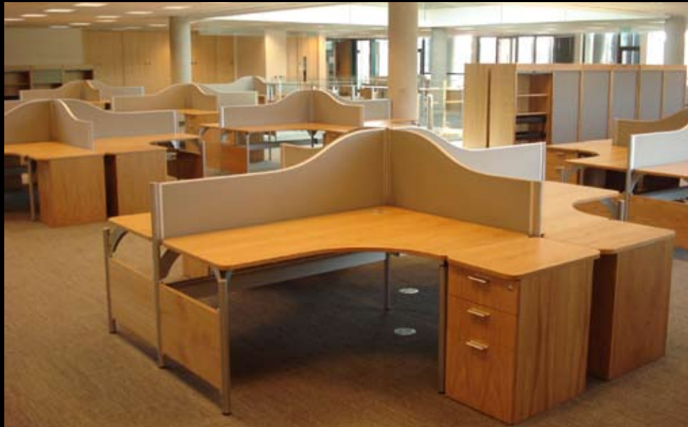
Open Plan Office Layout; Four Person Workstation & Tambour Storage Units

Brief: The OPW commissioned Farrell to manufacture and fit office furniture for the Dept. of Revenue Commissioners in Dublin. The project involved providing desking and storage for approximately 300 people over 4 floors. Farrell created an open plan layout throughout and fitted four and six person cluster workstations for optimum comfort and space management. Boardrooms were specially fitted with Maple boardroom tables with Walnut inlays. The job was completed in July 2007.