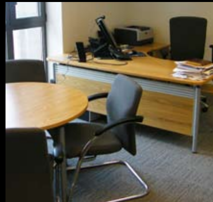
Typical Cellular Office; Single Person Workstation & Circular Table