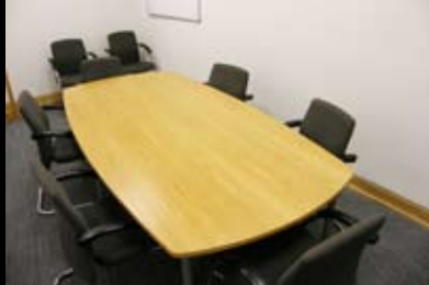
Six Person Meeting Table